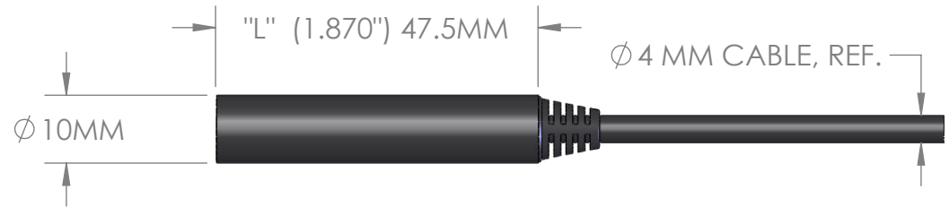
10MM 1/4" CCD CAMERA W/O LENS